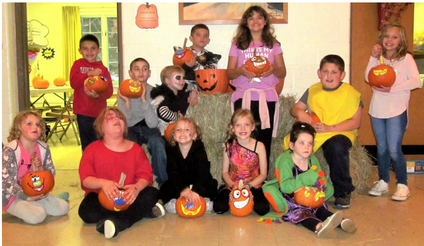
Many of the children gather for a photo op with their decorated pumpkins

A very sincere thank you for everyone who helped in any way with the Harvest Party. The manpower, candy, goodies, and prayers were greatly appreciated. Around 70-75 total adults & children attended and had a wonderful time of fellowship.